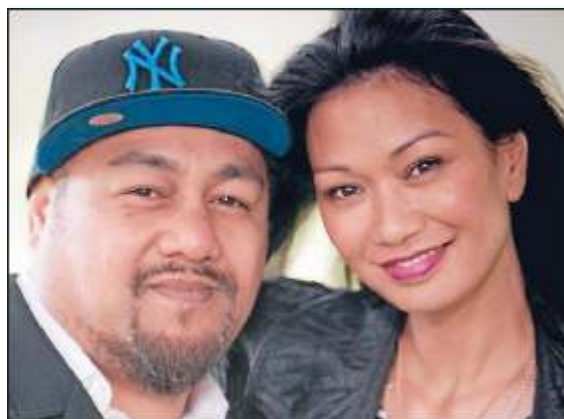
Dynamic duo: Che Fu and Boh Runga